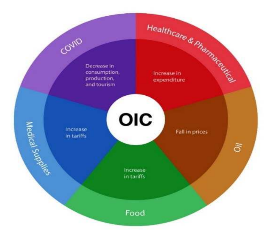
Figure 1. Methodology Wheel